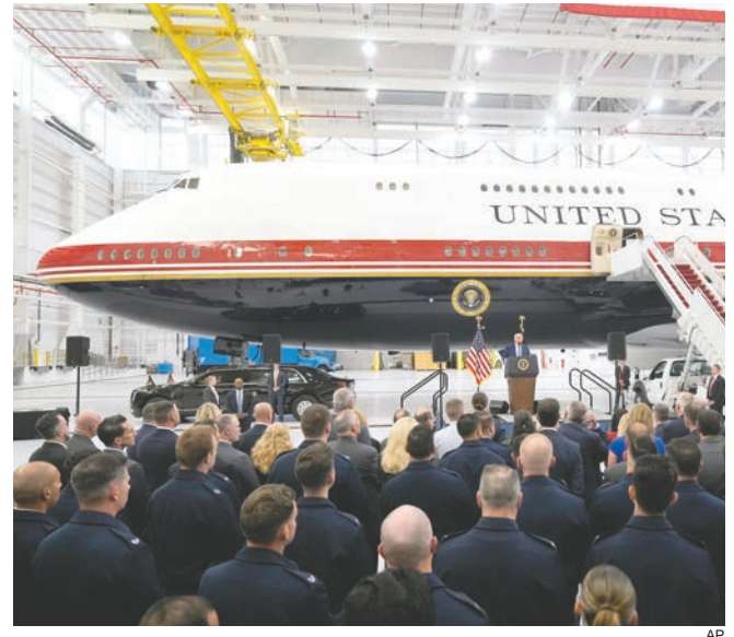
President Donald Trump speaking after touring the newly designated Air Force One presidential aircraft at Joint Base Andrews, Maryland, on Friday.

"Now, when we land at airports in London and in Germany and different places, nobody tops this one, and that's the way we have to have it for our country," Trump said, noting that the colours