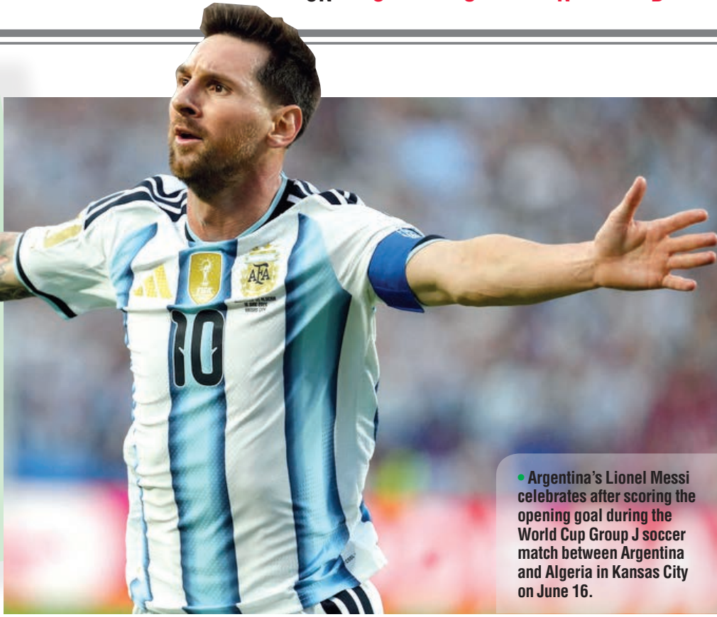
Argentina's Lionel Messi celebrates after scoring the opening goal during the World Cup Group J soccer match between Argentina and Algeria in Kansas City on June 16.

Inside the colourful, compelling and controversial jersey designs at the World Cup