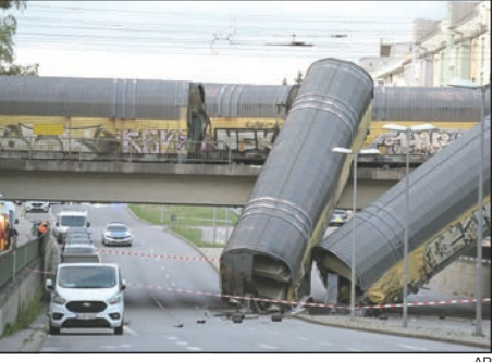
Two cars of a freight train lying on a road after falling off a bridge in Munich, on Saturday. One person was killed.