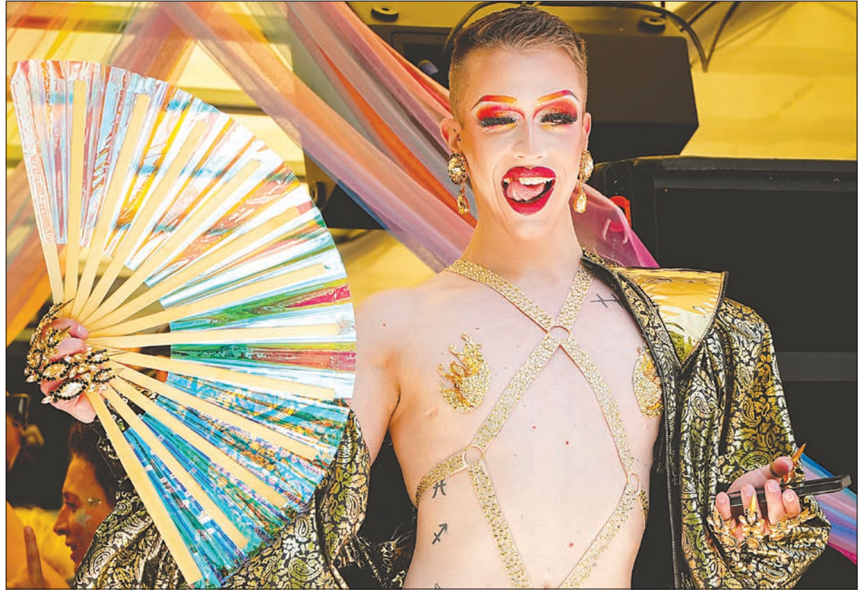
A person dancing during the Zürich Pride parade in Zürich, Switzerland, on Saturday.