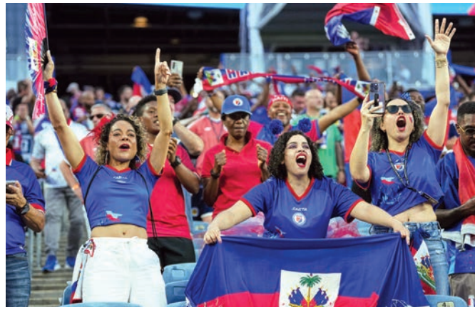
Haiti supporters react ahead of the World Cup Group C soccer match between Haiti and Scotland in Foxborough on June 13.

of a pipe — the words: "Ceci n'est pas une pipe" (This is not a pipe)." The light-blue jersey features pink patterns and black detailing, incorporating soccer-inspired motifs such as pitch lines and a ball. "True to the surrealism theme, the kit sparks the imagination and invites conversation," the Belgian federation says.