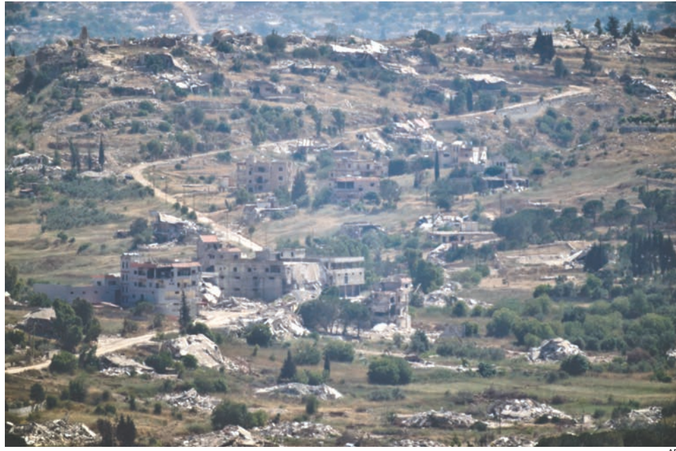
Destroyed buildings in a village in southern Lebanon as seen from northern Israel, on Saturday.

Today, Hezbollah said it had committed to the ceasefire but blamed Israel for violating it several times on Friday night. A statement issued by the group's military wing said it