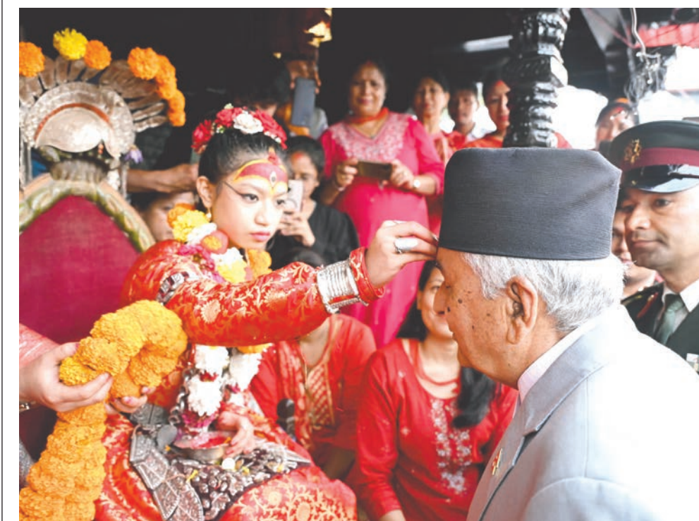
An employee of the Guthi Sansthan displaying Bhoto (top) and President Ramchandra Paudel receiving tika from the living goddess Kumari (bottom) during the Bhoto Jatra of Rato Machhindranath , considered the god of rain and seasons, in Jawalakhel, Lalitpur, on Saturday.